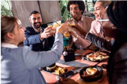
Help Guests Unwind